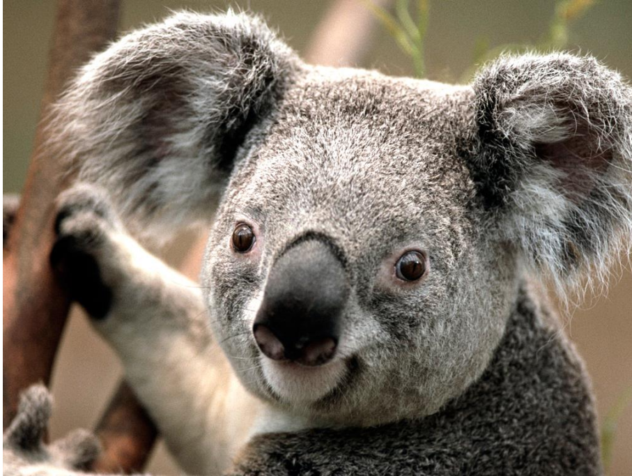
Figure 1-1. Cute koala.