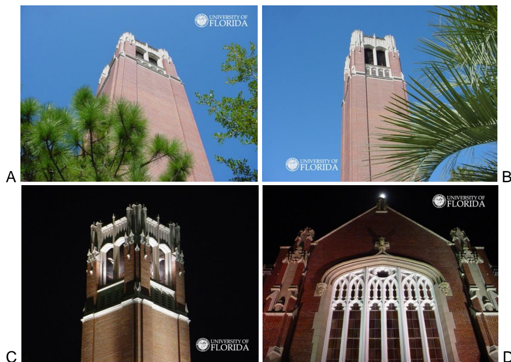
Figure 3-2. Series of University of Florida landmarks. A) Taken from the base of Century Tower looking upward at 3:00 PM, B) taken from the northwest corner of the Music Building, C) taken from the CSE atrium at 9:00 PM and D) the University Auditorium. A, B, & D are labeled correctly but C is ambiguous. (Note: the caption in the list of figures does not include the sub-part