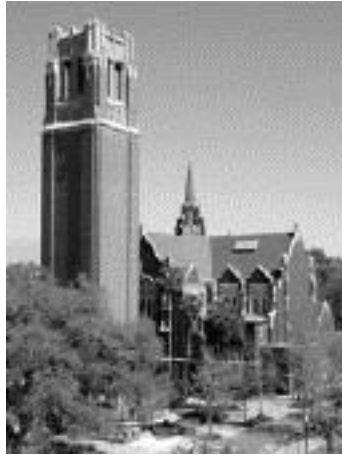
Figure 3-1. Century Tower taken in 1999 from Jim Albury's office window.